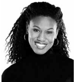
Priscilla Shirer leads the "Going Beyond" event, October 8–9 in Columbia